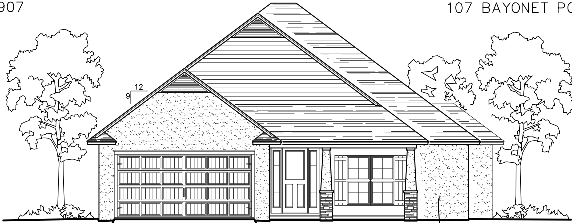
STUCCO EXTERIOR FRONT ELEVATION