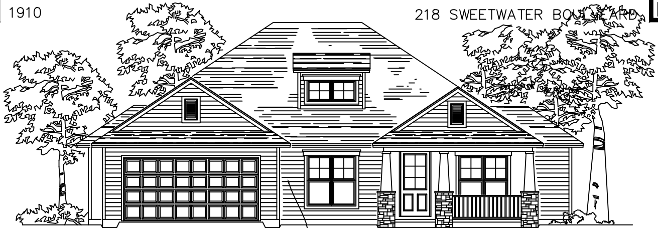
LAP VINYL SIDING FRONT ELEVATION