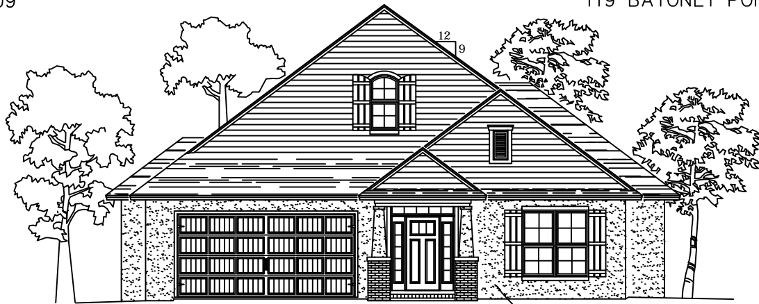
48'-10" STUCCO EXTERIOR FRONT ELEVATION